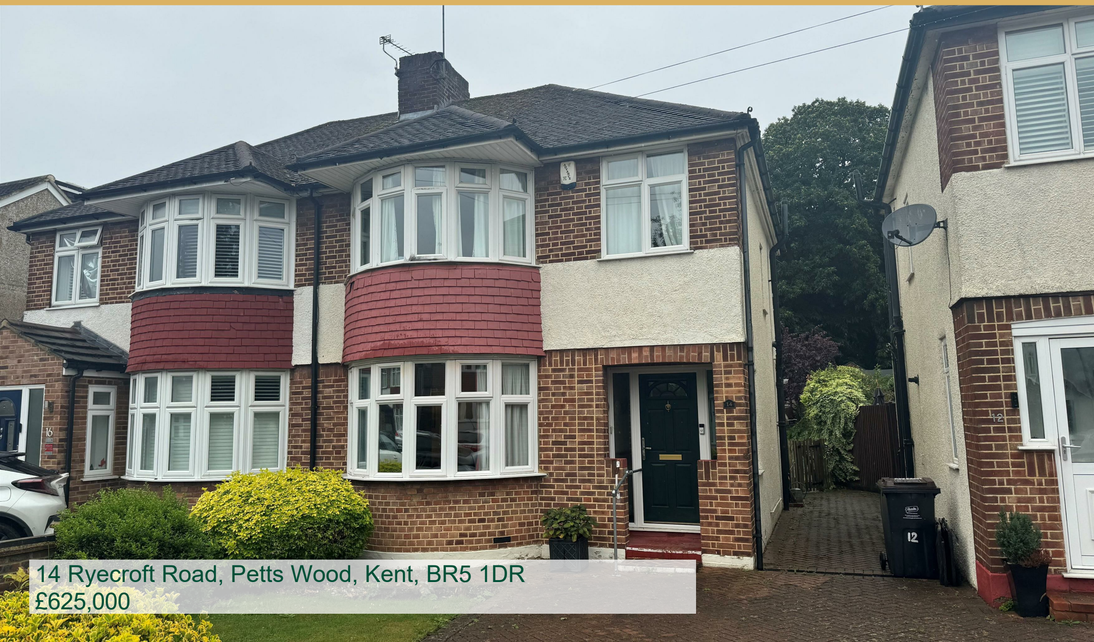
14 Ryecroft Road, Petts Wood, Kent, BR5 1DR £625,000