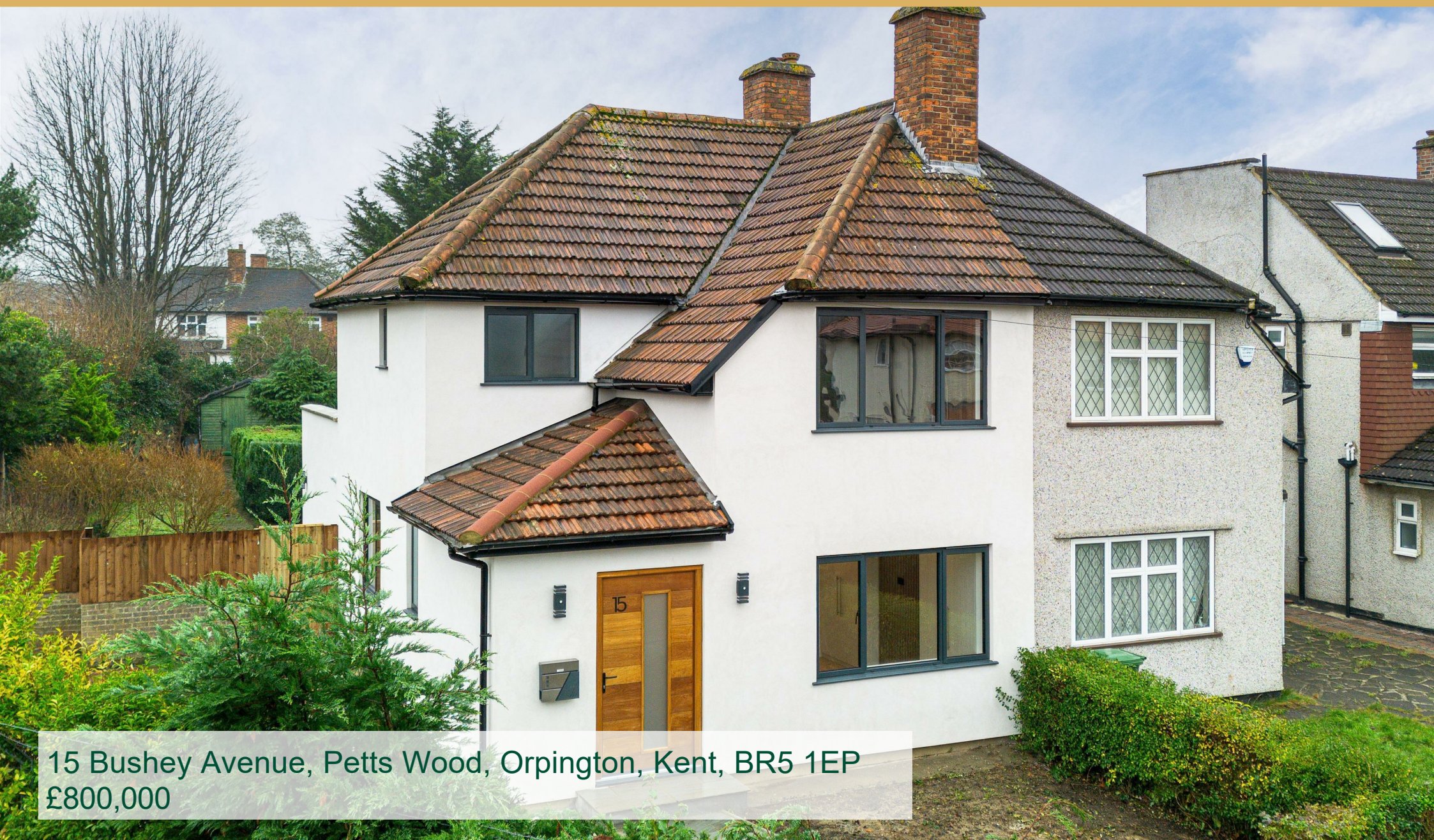
15 Bushey Avenue, Petts Wood, Orpington, Kent, BR5 1EP £800,000