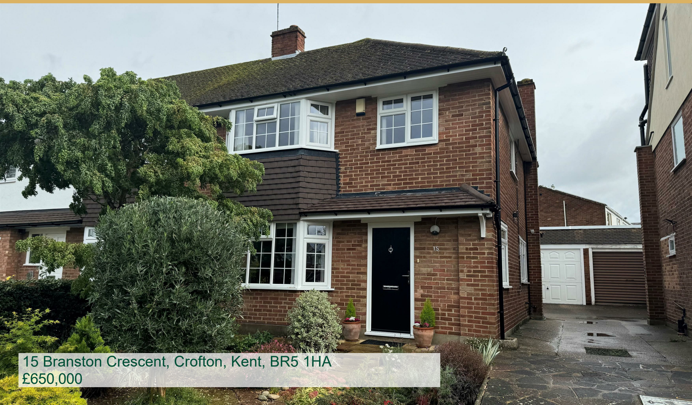
15 Branston Crescent, Crofton, Kent, BR5 1HA £650,000