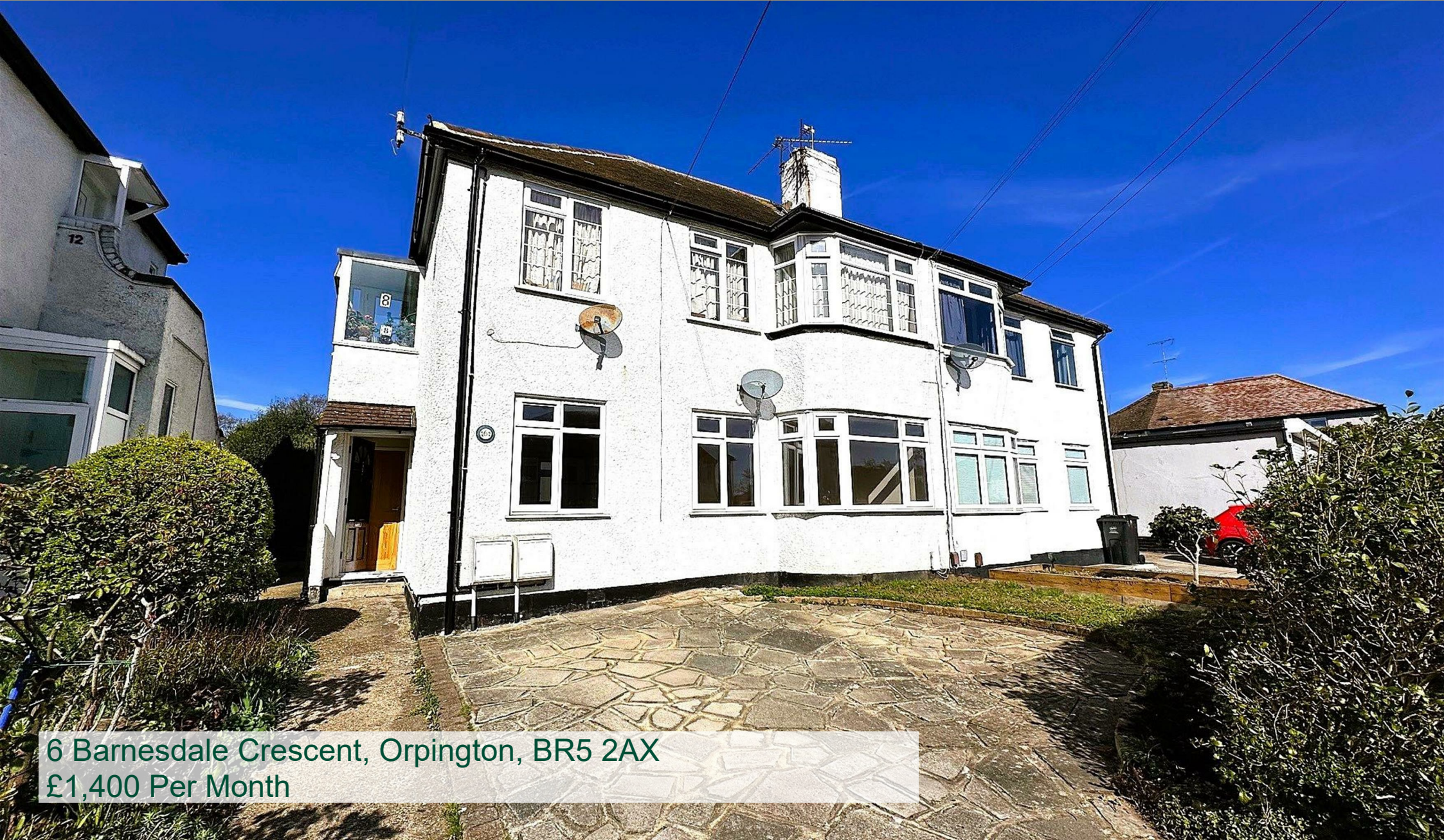
6 Barnesdale Crescent, Orpington, BR5 2AX £1,400 Per Month