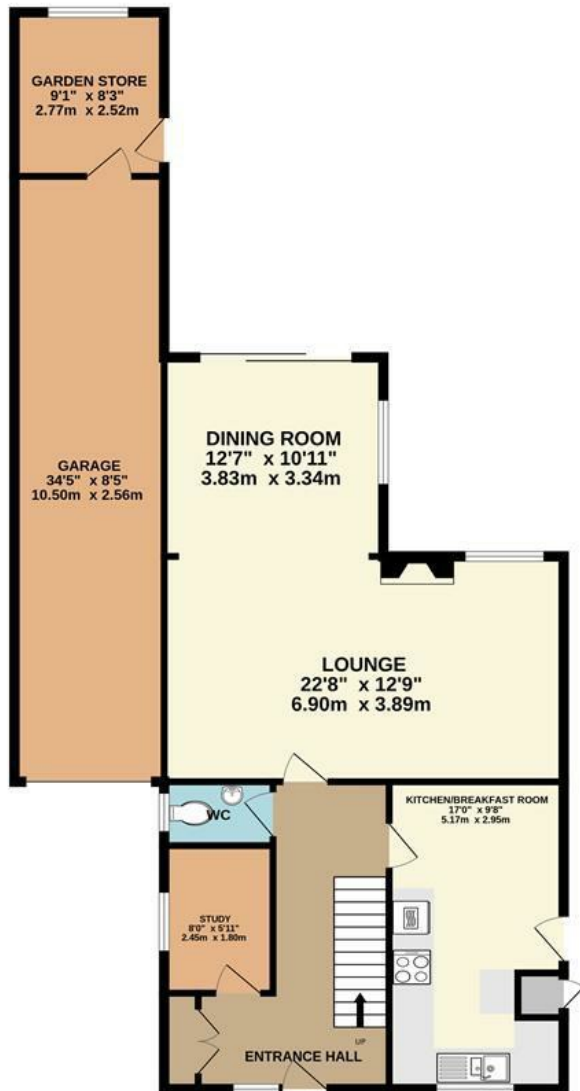
GROUND FLOOR 1187 sq.ft. (110.3 sq.m.) approx.