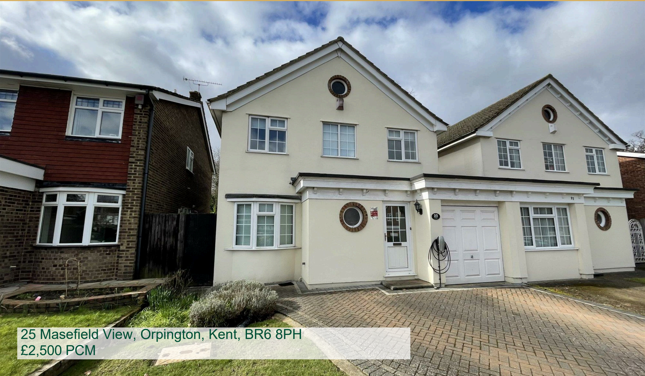
25 Masefield View, Orpington, Kent, BR6 8PH £2,500 PCM