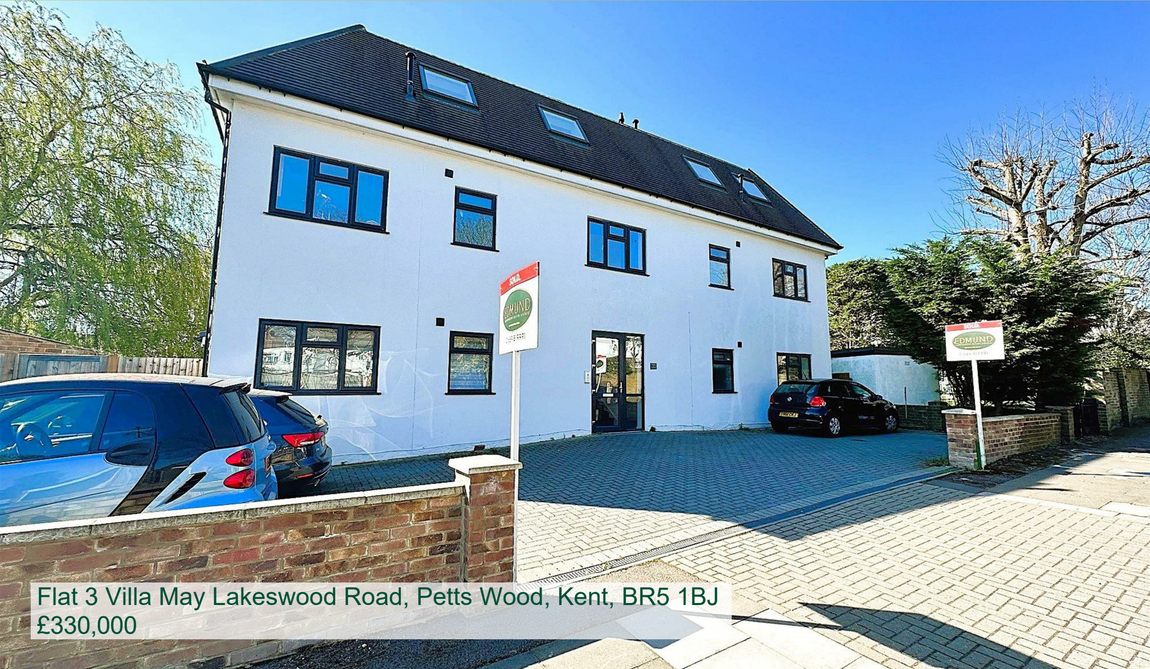
Flat 3 Villa May Lakeswood Road, Petts Wood, Kent, BR5 1BJ £330,000