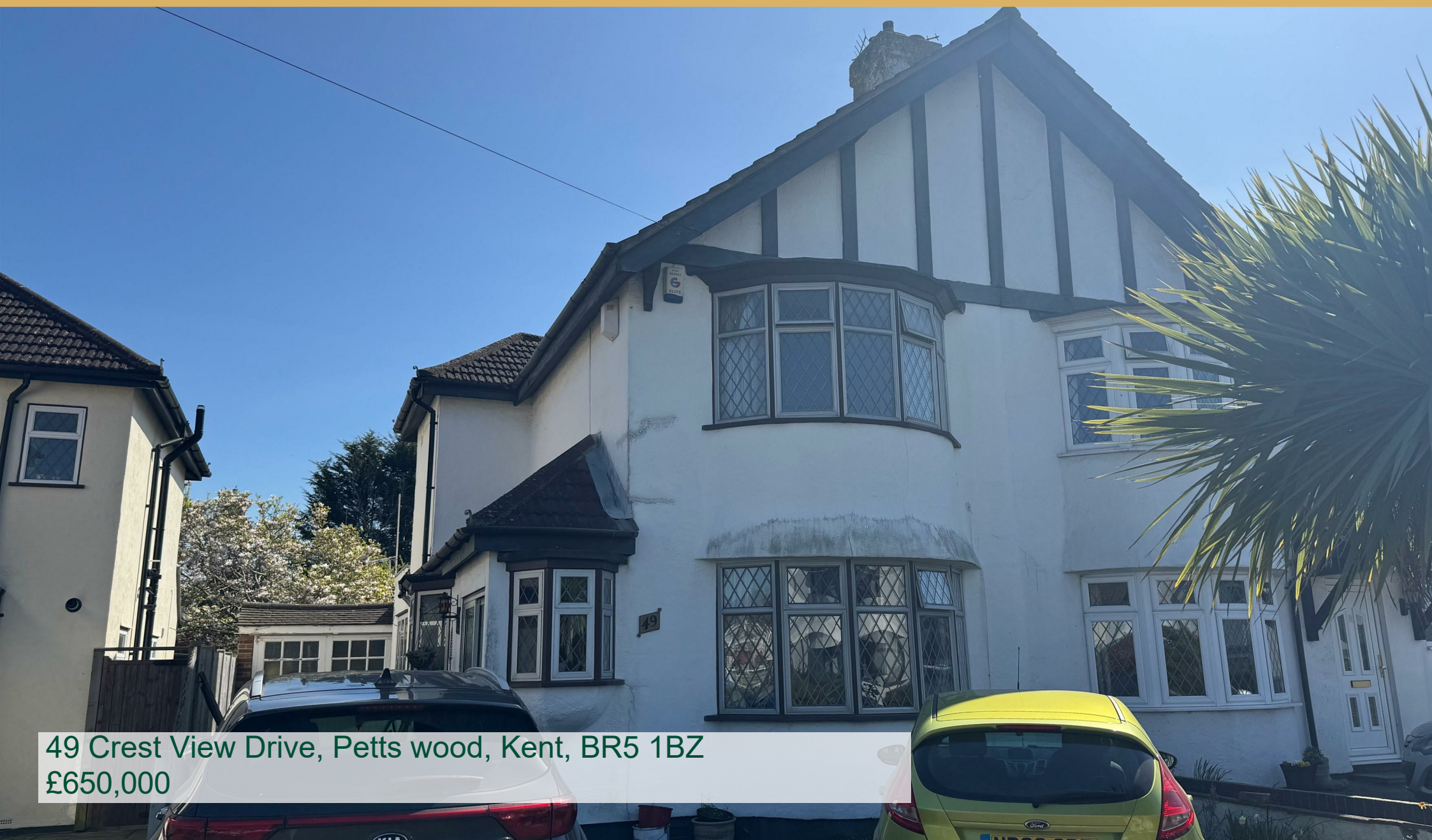
49 Crest View Drive, Petts wood, Kent, BR5 1BZ £650,000