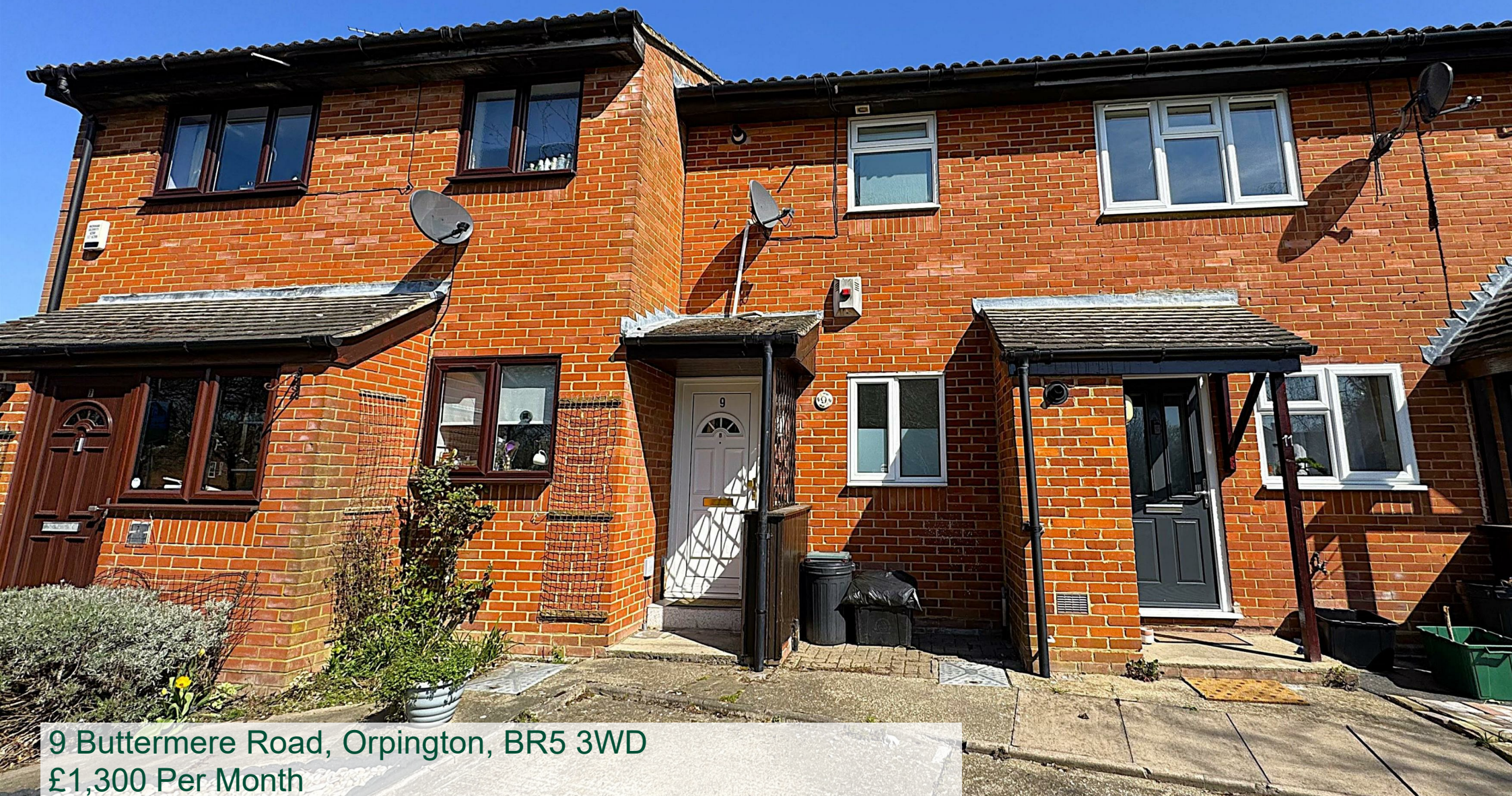
9 Buttermere Road, Orpington, BR5 3WD £1,300 Per Month