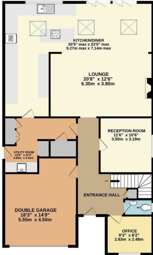
GROUND FLOOR 1485 sq.ft. (137.9 sq.m.) approx.