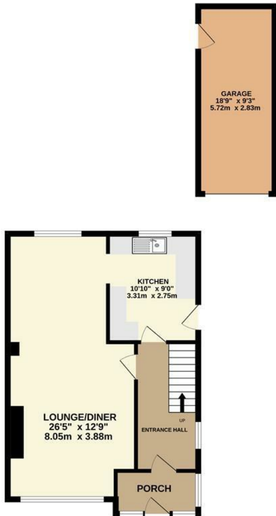
GROUND FLOOR 653 sq.ft. (60.6 sq.m.) approx.