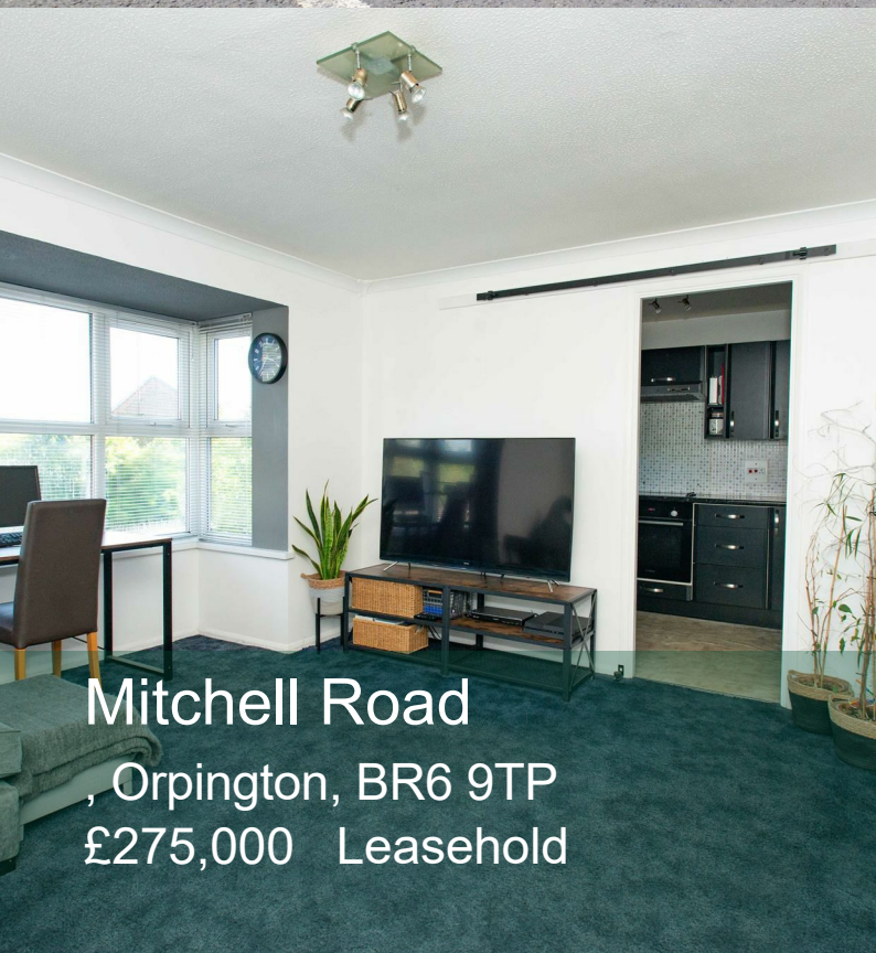
Mitchell Road , Orpington, BR6 9TP £275,000 Leasehold