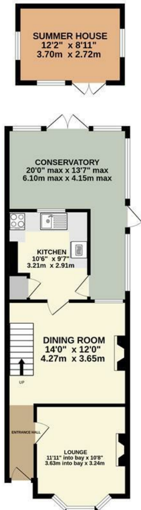
GROUND FLOOR 696 sq.ft. (64.6 sq.m.) approx.