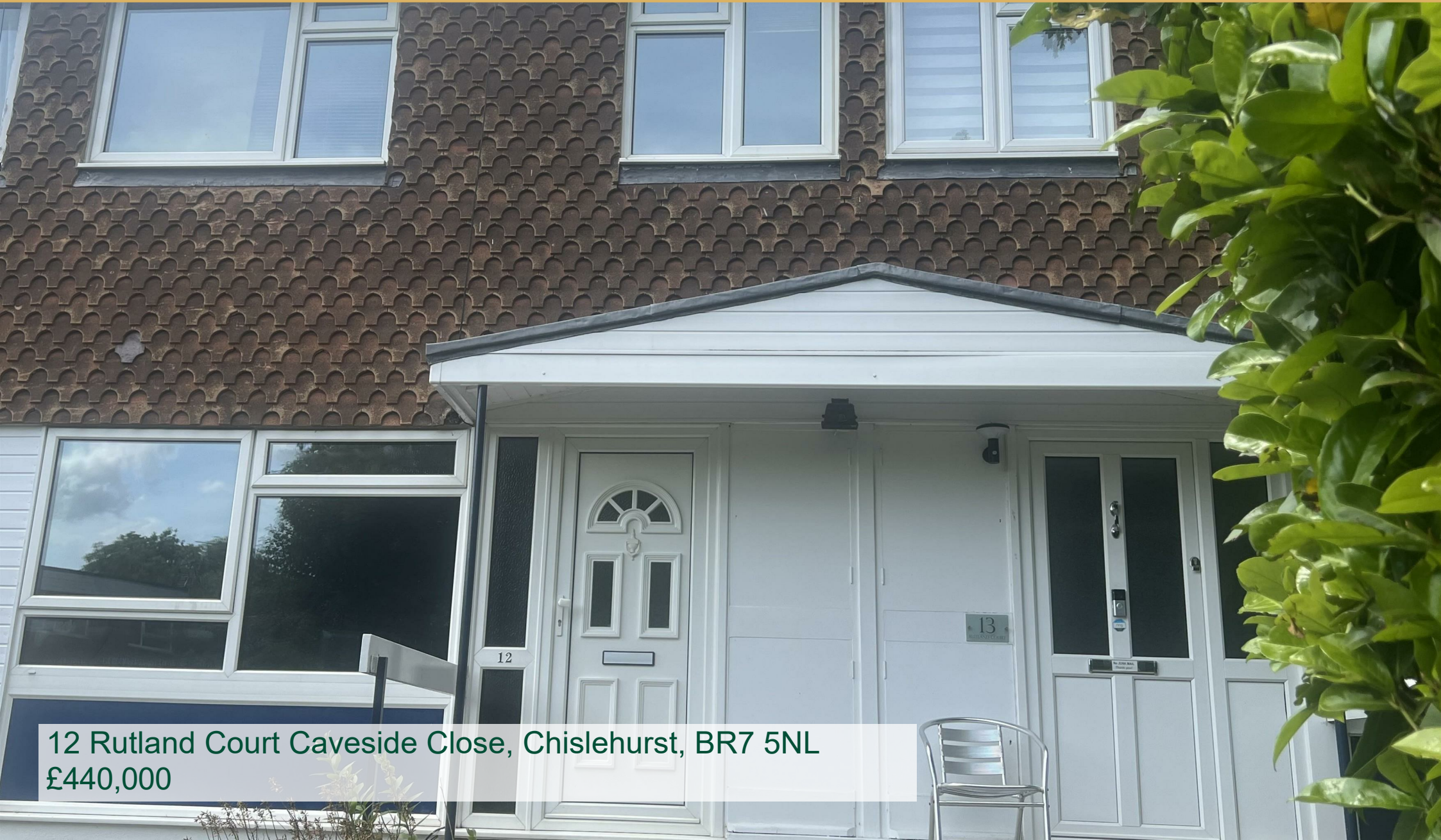
12 Rutland Court Caveside Close, Chislehurst, BR7 5NL £440,000