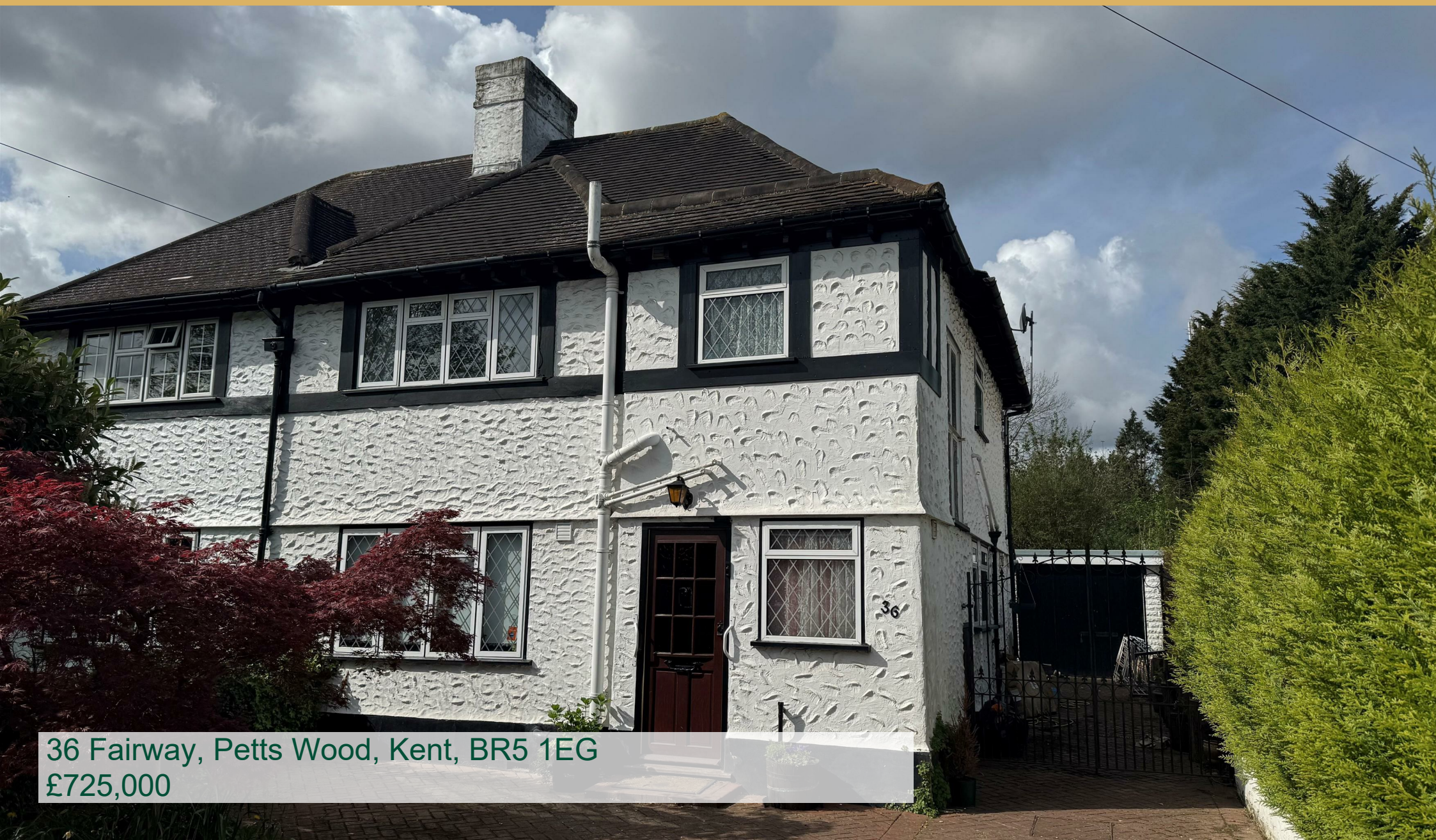
36 Fairway, Petts Wood, Kent, BR5 1EG £725,000