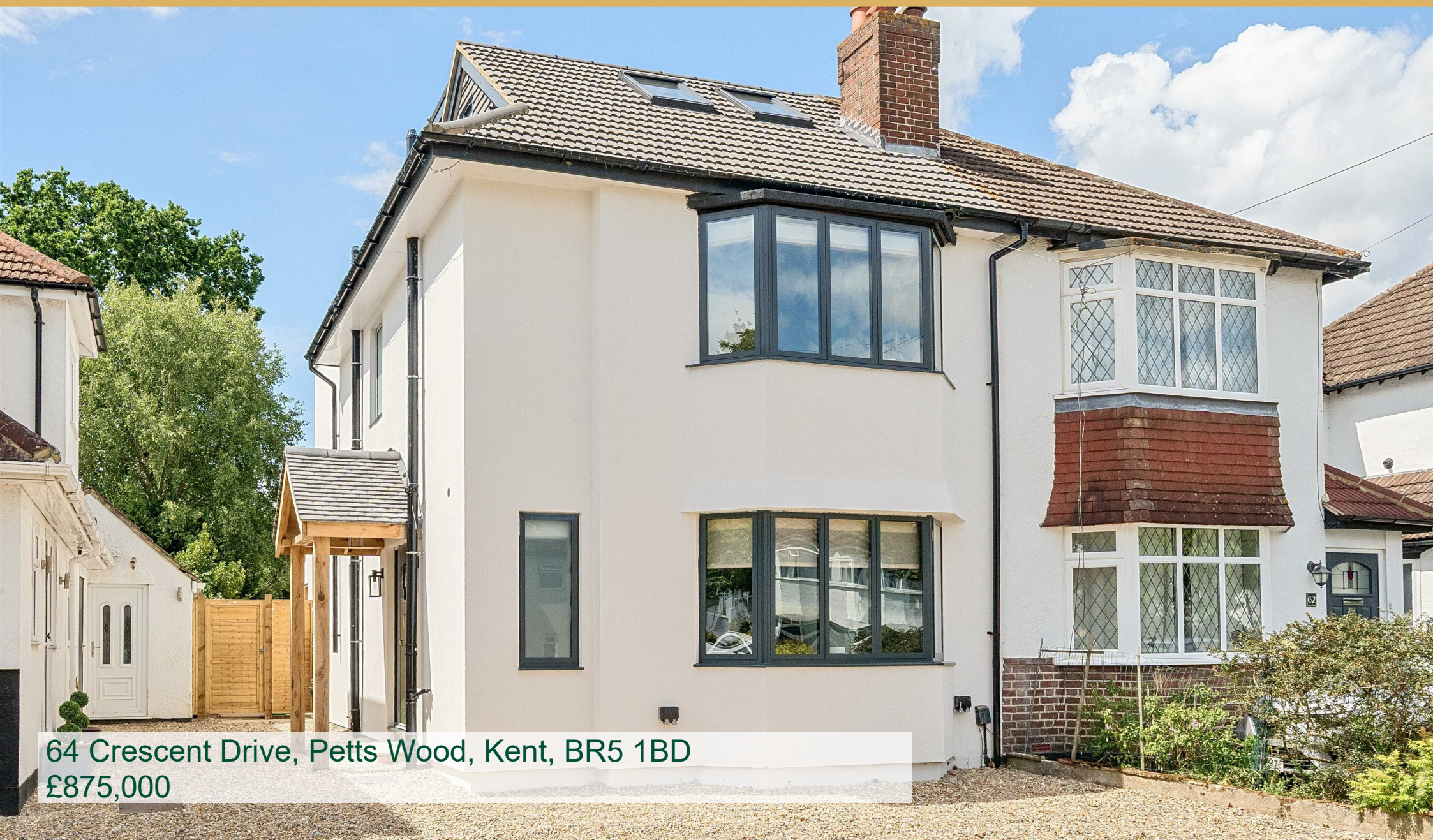
64 Crescent Drive, Petts Wood, Kent, BR5 1BD £875,000