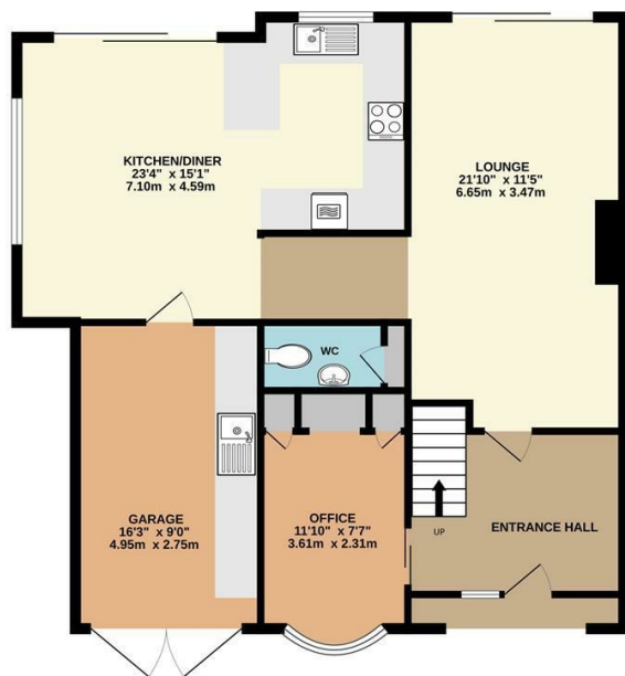
GROUND FLOOR 979 sq.ft. (90.9 sq.m.) approx.