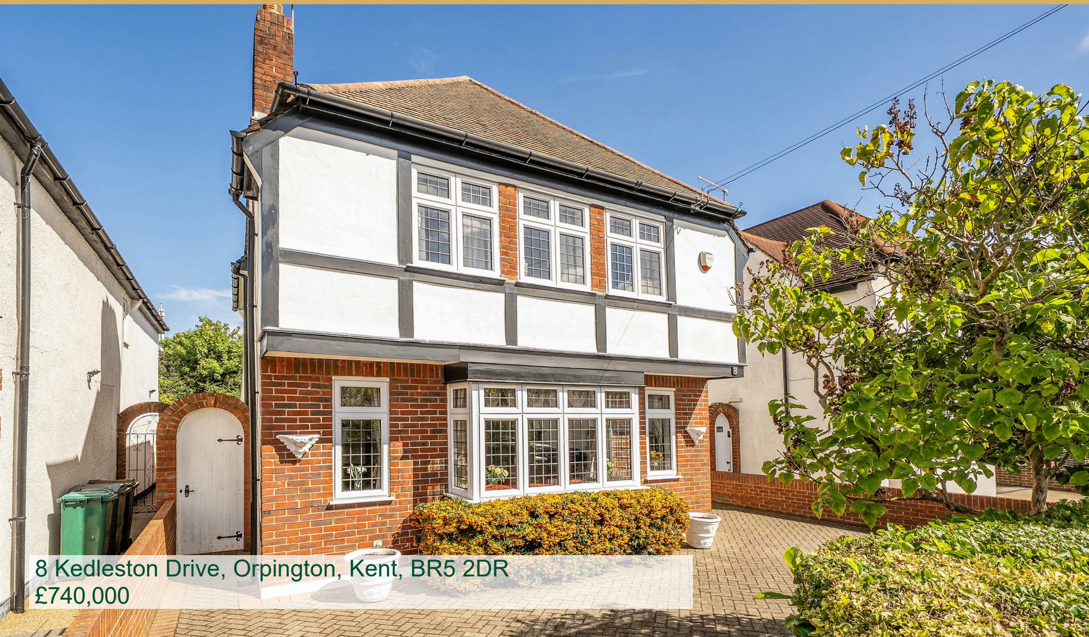
8 Kedleston Drive, Orpington, Kent, BR5 2DR £740,000