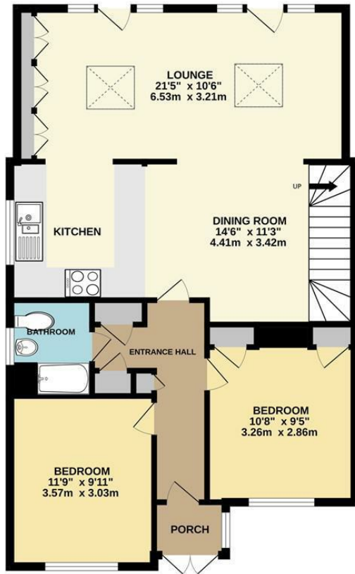
GROUND FLOOR 847 sq.ft. (78.7 sq.m.) approx.