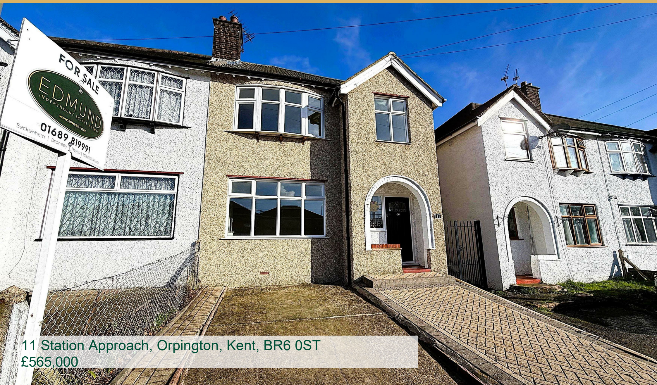
11 Station Approach, Orpington, Kent, BR6 0ST £565,000