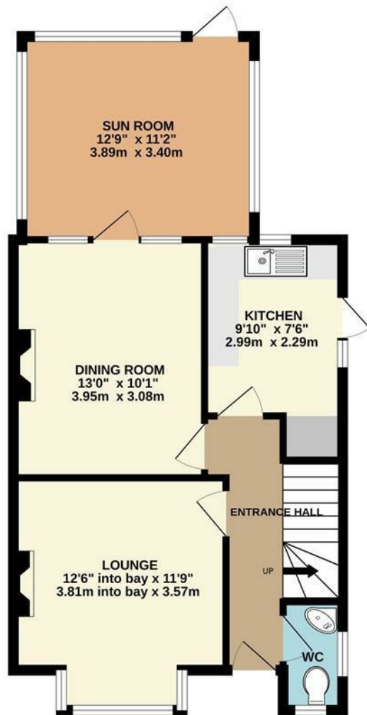
GROUND FLOOR 585 sq.ft. (54.3 sq.m.) approx.