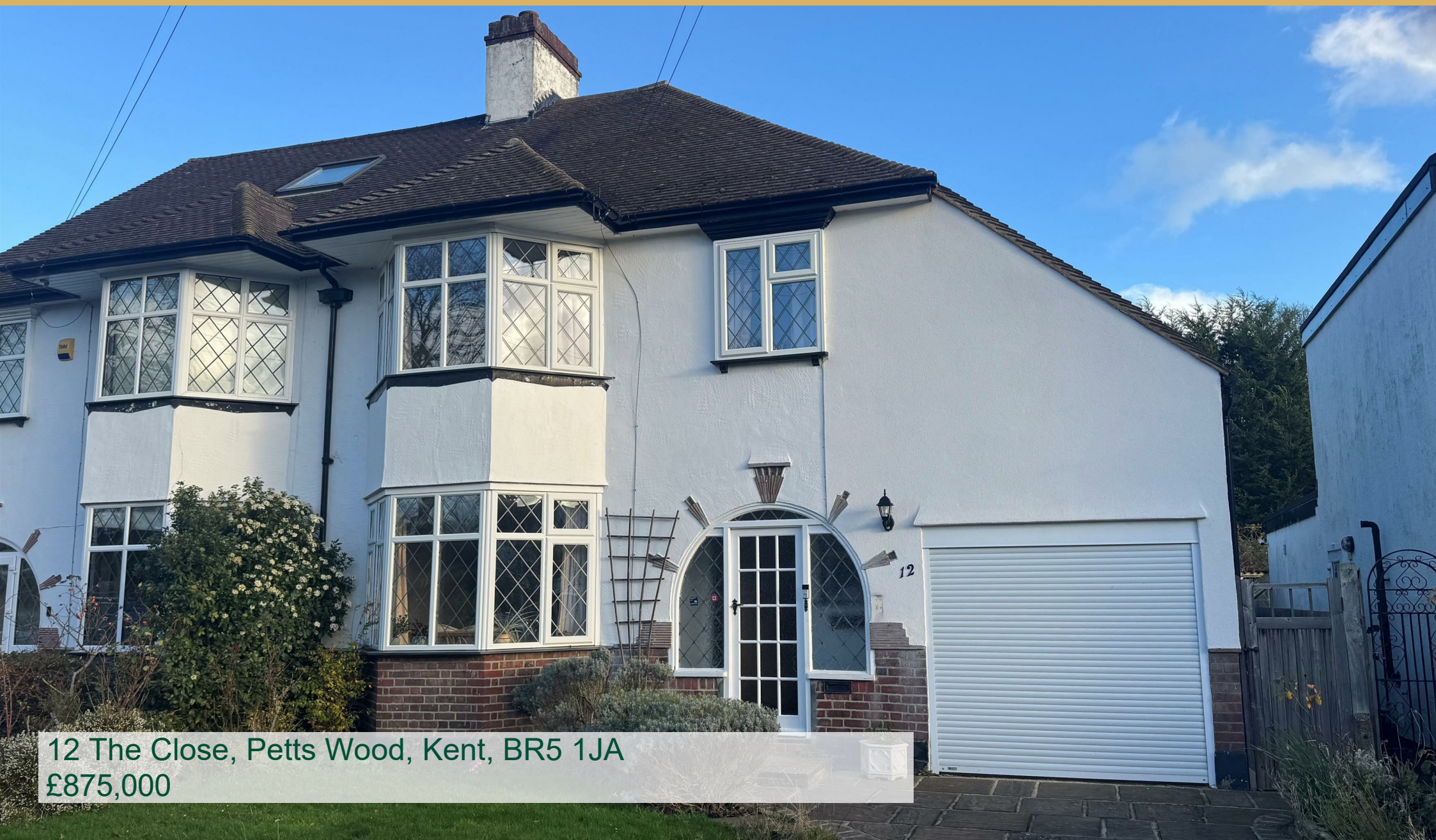
12 The Close, Petts Wood, Kent, BR5 1JA £875,000