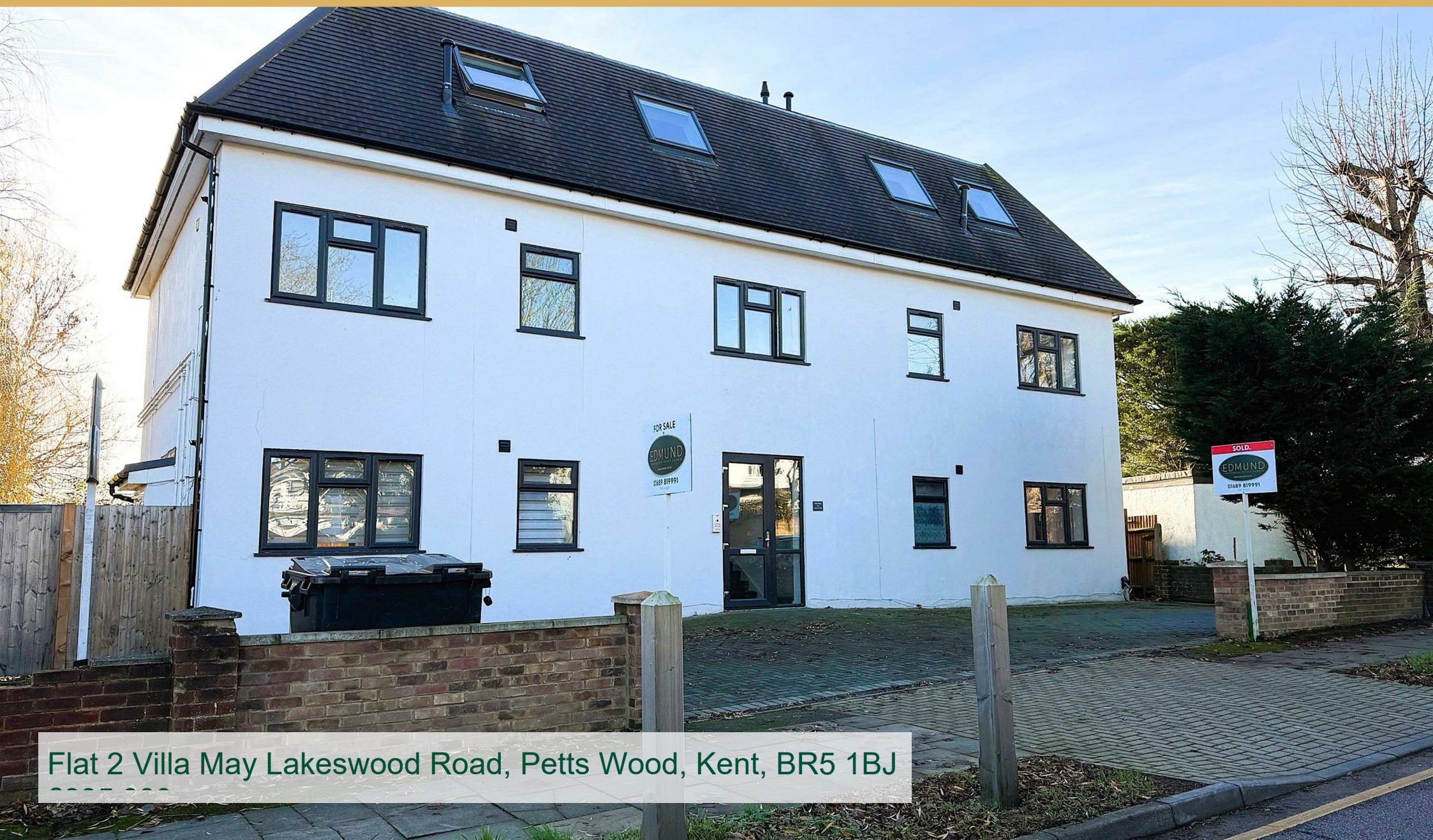
Flat 2 Villa May Lakeswood Road, Petts Wood, Kent, BR5 1BJ