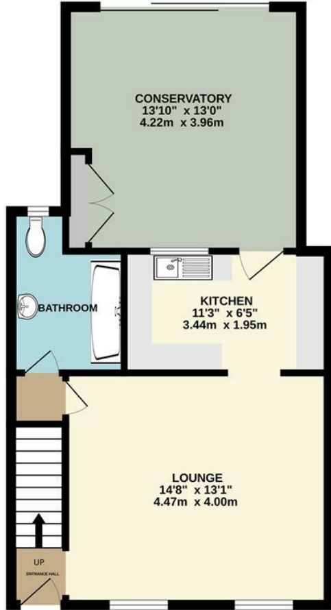
GROUND FLOOR 550 sq.ft. (51.1 sq.m.) approx.