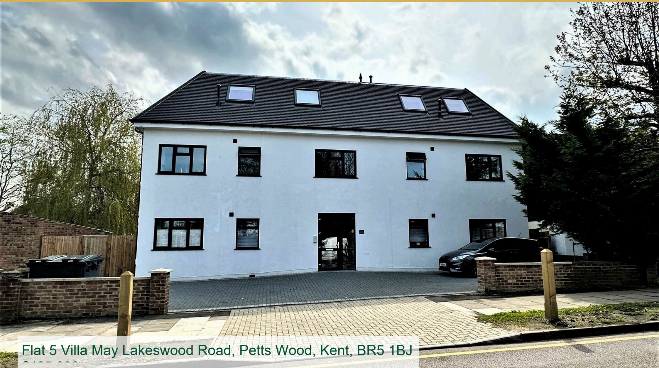
Flat 5 Villa May Lakeswood Road, Petts Wood, Kent, BR5 1BJ