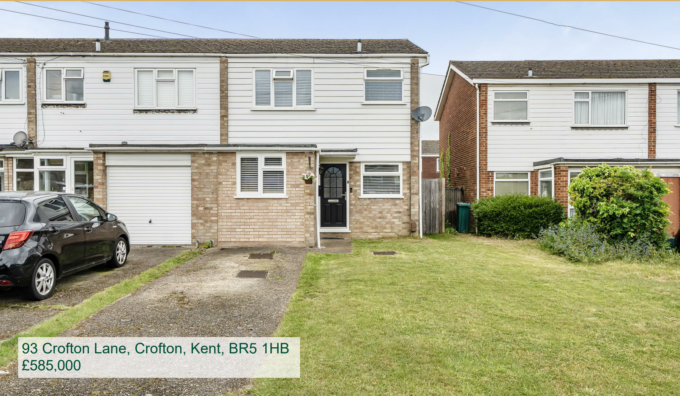
93 Crofton Lane, Crofton, Kent, BR5 1HB £585,000