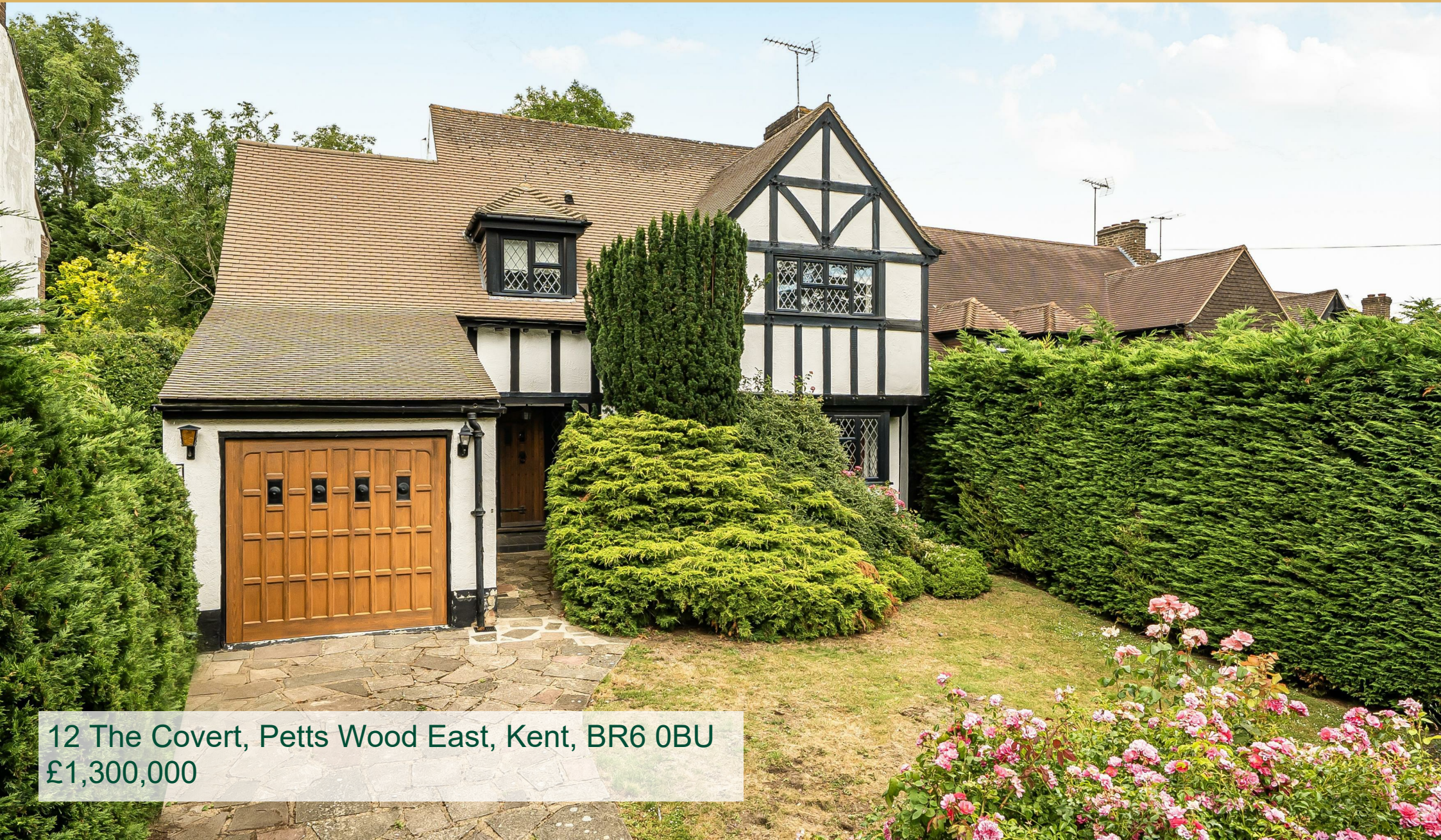
12 The Covert, Petts Wood East, Kent, BR6 0BU £1,300,000